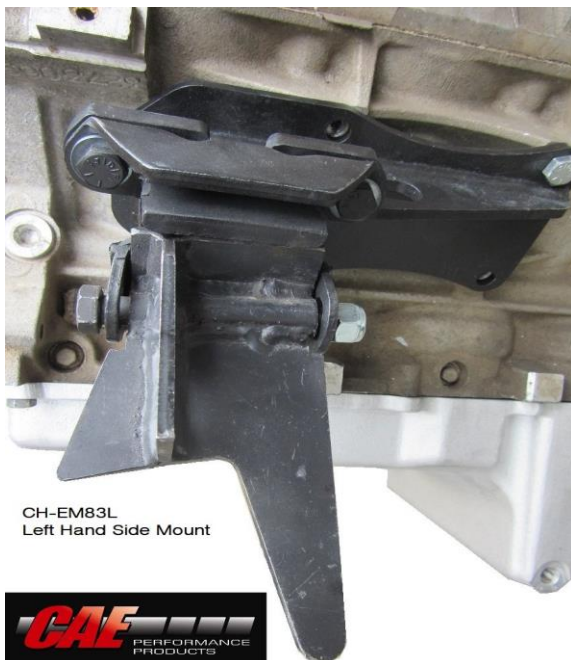
CH-EM83L Left Hand Side Mount

NOTE: Alternator will be close to or touching Crossmember. Modification around this section will be required.