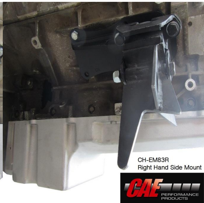
CH-EM83R Right Hand Side Mount